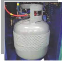
20kg large capacity tank