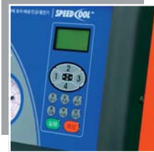
Graphic LCD (128X64)