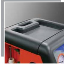
Un fragile special plastic