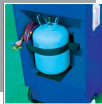
Refrigerant tank hanger